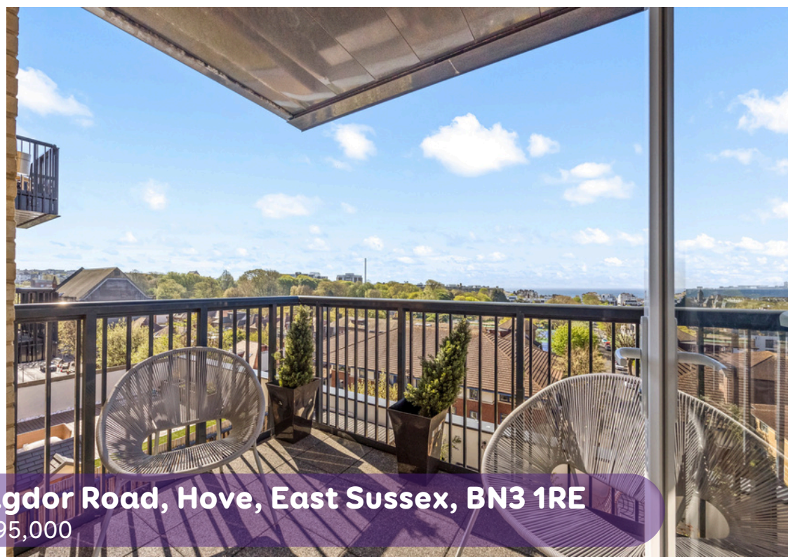
Flat 48, Gradino Apartments, 119 Davigdor Road, Hove, East Sussex, BN3 1RE £595,000